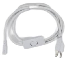
6ft On/Off Cable